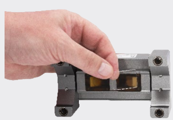
Placing the couplant pads before installation to the downside part of the main unit