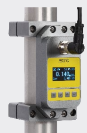
Vertical installation on a water pipe